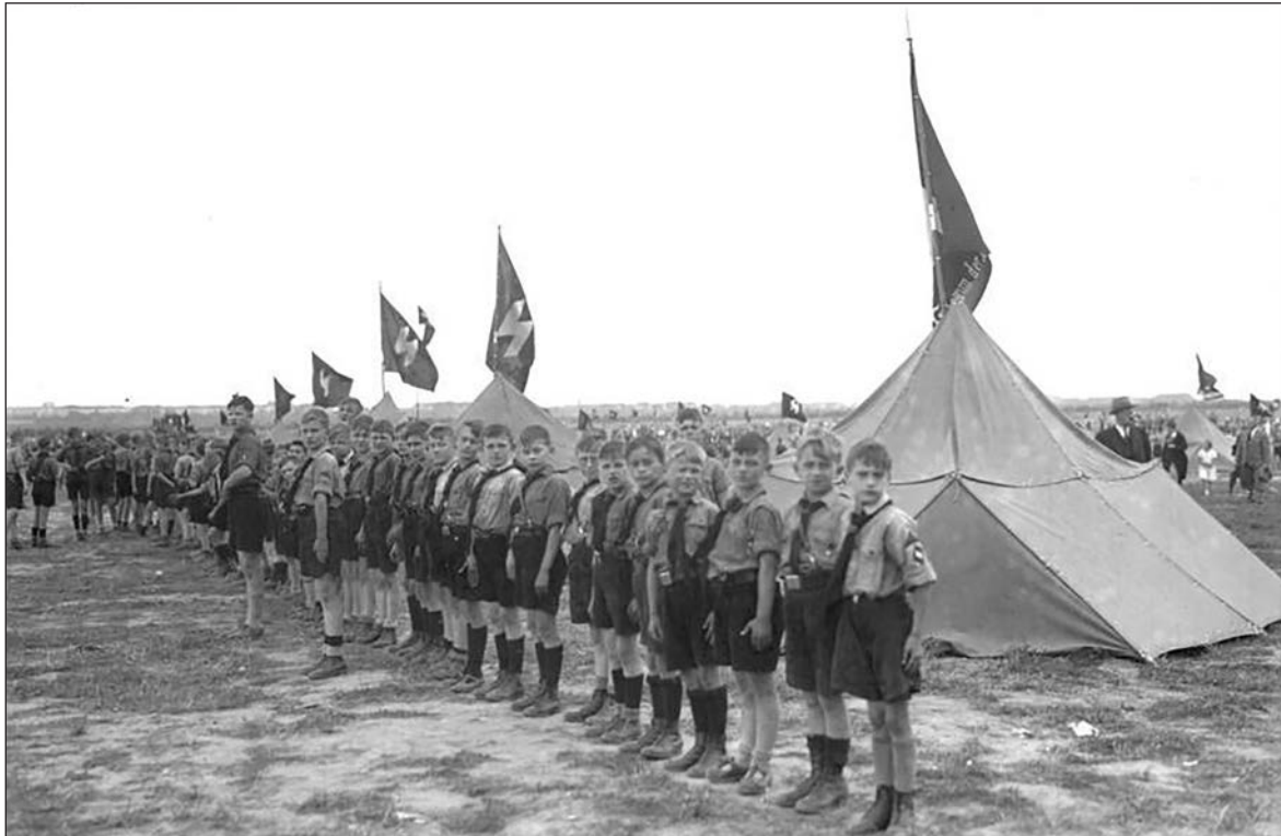
[A photograph of a Hitler Youth camp at Templehof Field in Berlin, 1934]